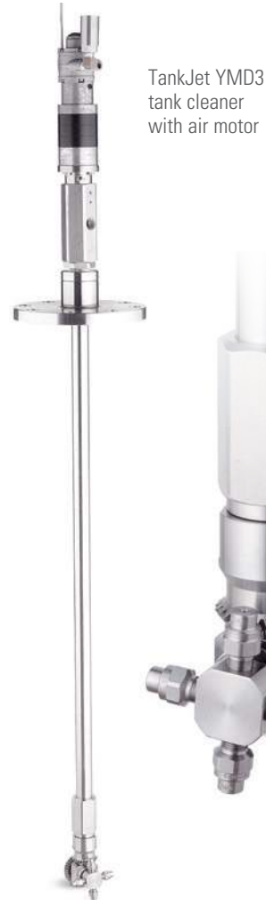
TankJet YMD3 tank cleaner with air motor